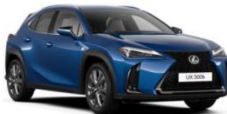
Celestial Blue (8Y6)