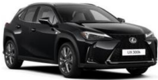
Astral Black (212)