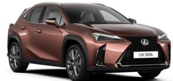
New: Sonic Copper (4Y5)