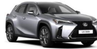
Sonic Platinum (1L2)