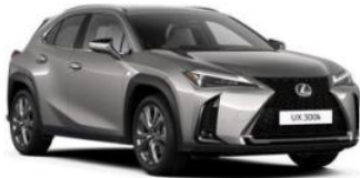
Sonic Titanium (1J7)