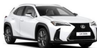
F White (083)