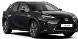
Graphite Black (223)