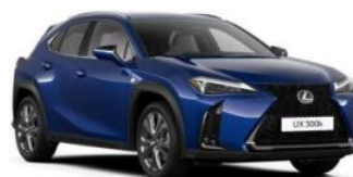
Sapphire Blue (8X1)