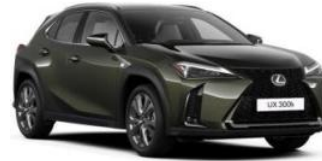
Terrane Khaki (6X4)