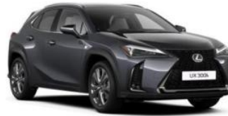
Sonic Grey (1L1)