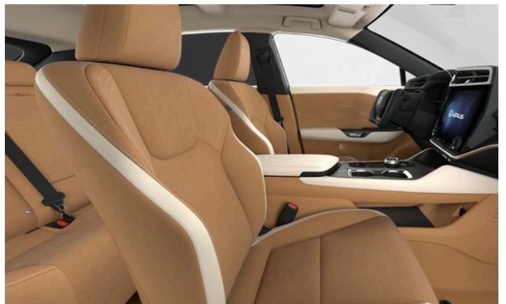
Hazel Ultra Suede (FA40)