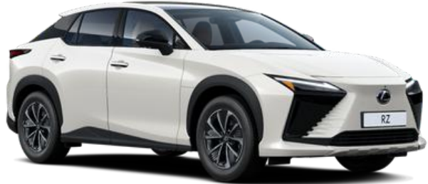
Sonic White Pearl (090) **