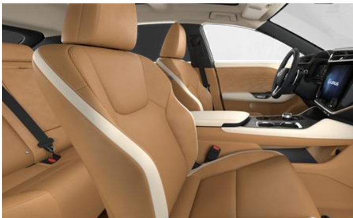
Hazel Tahara Leather(EA40)