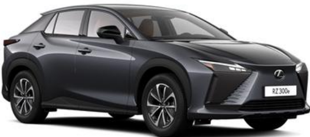
Sonic Grey (1L1) *