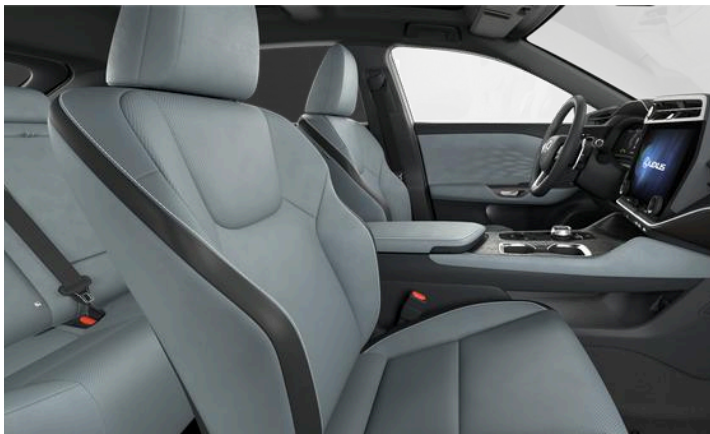
Orange Tahara Leather (EA80)