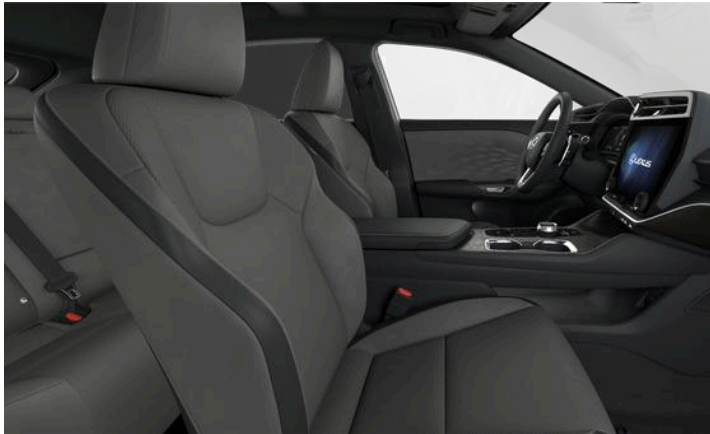
Grayscale Tahara Leather (EA10)