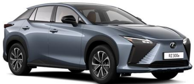
Aether (82Z) *