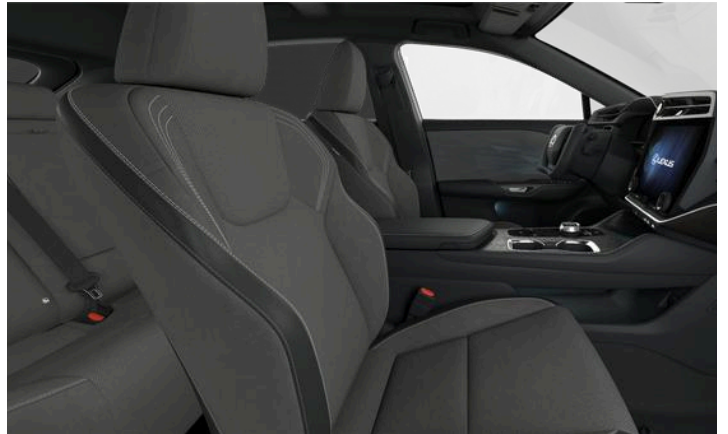
Grayscale Ultra Suede (FA10)