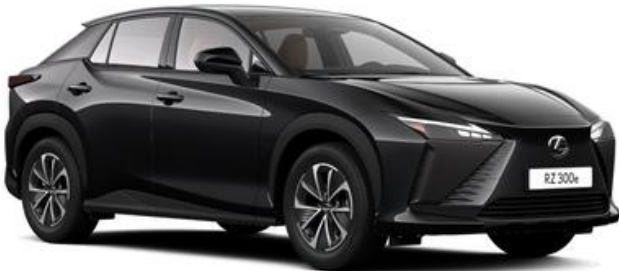
Graphite Black (223) *