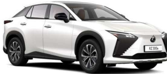
Sonic White (085)