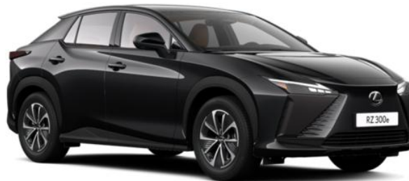
Graphite Black (223)