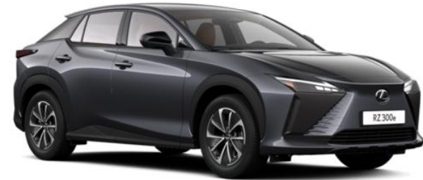
Sonic Grey (1L1)