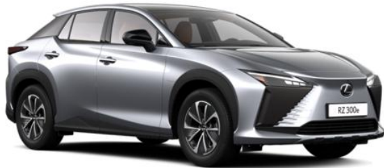
Sonic Platinum (1L2)