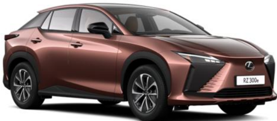
Sonic Copper (4Y5) *