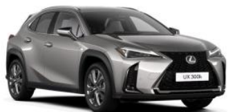
Sonic Titanium (1J7)