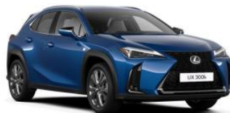
Celestial Blue (8Y6)