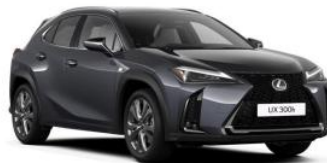
Sonic Grey (1L1)