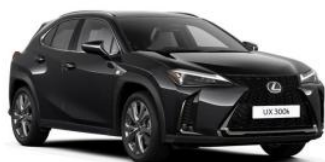
Graphite Black (223)