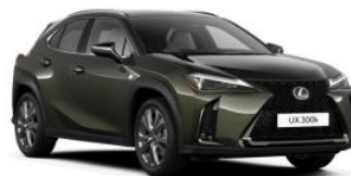
Terrane Khaki (6X4)