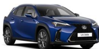
Sapphire Blue (8X1)