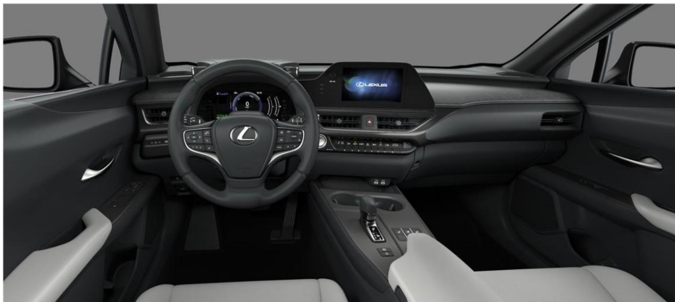
Image displays 8" Multimedia Display. F SPORT Design equipped with a 12.3" Multimedia Display, as per grade page.