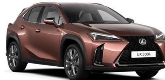
New: Sonic Copper (4Y5)