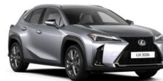
Sonic Platinum (1L2)