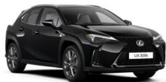
Astral Black (212)