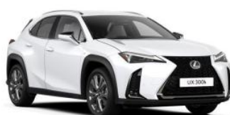
F White (083)